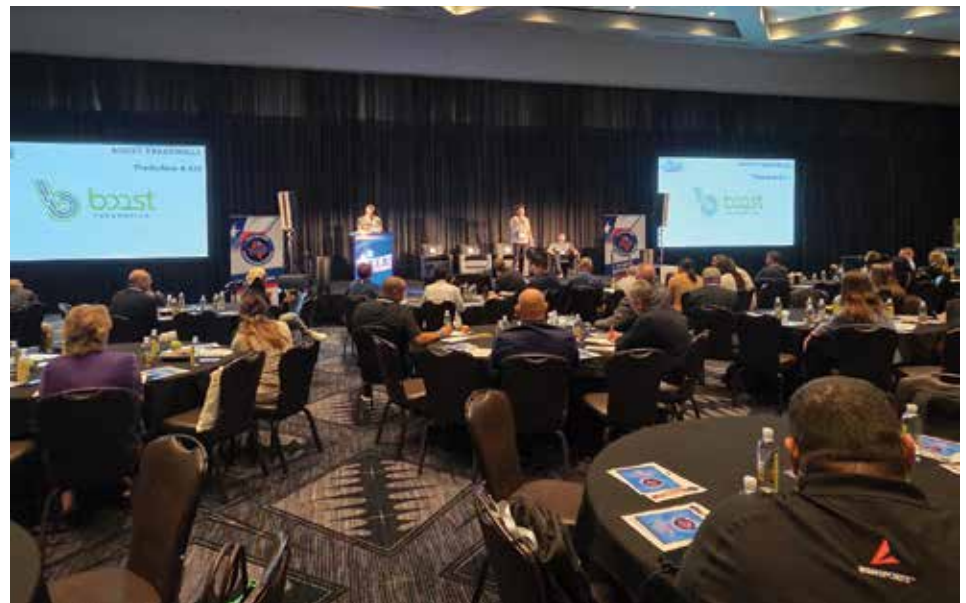
Innovative Showcase Live! at the 2025 State Conference brought together 20 companies each presenting their brands in a two-minute segment on stage before nearly 200 attendees.

years earlier had launched Under Armour as a start-up from his grandmother's basement. Within 15 years, Under Armour generated $1B+ in sales.