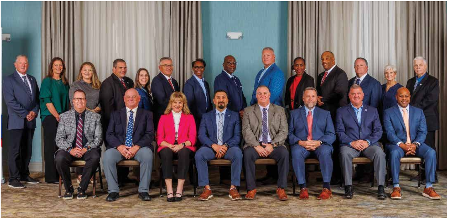
THSADA Board of Directors December 2025

This past December 3rd and 4th the THSADA Board of Directors and Committee Chairs met in Houston at the Hilton Garden Inn Hotel at Hobby Airport to conduct the business of the THSADA. As it always does, the Board meeting provided an opportunity for Officers, Region Directors, and Committee Chairs to not only conduct the affairs of the THSADA but also provided Board members the opportunity to discuss issues specific to athletic administrators during several social gatherings held in conjunction with the Board meeting. PBK again functioned as a host