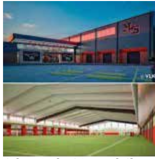
Galena Park I.S.D.-North Shore

hosting youth programs, camps, and events, increasing overall value to taxpayers. When positioned as safety-driven, multi-use, community-centered investments rather than luxury athletic upgrades, indoor facilities gained broader support.