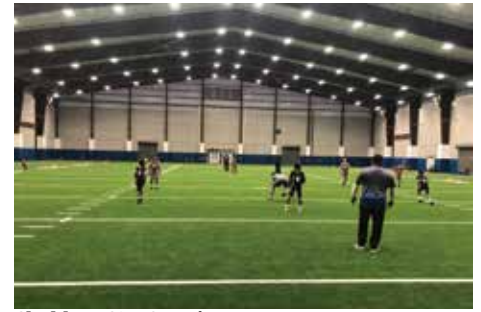
Sheldon ISD - C.E. King

If asked, nearly every coach of an outdoor sport would advocate for an indoor practice facility. However, even a basic structure — including turf, lighting, and minimal support space — can cost between $2 million and $5 million, which presents a significant financial hurdle for many districts. Research suggests that the average